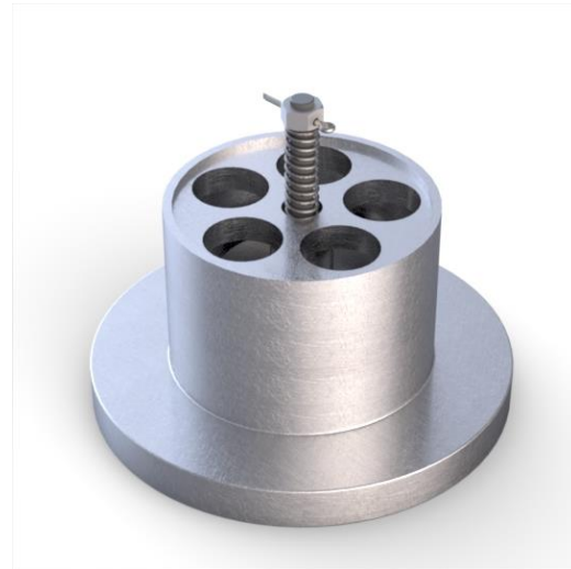
Figure 2: Photo of Valve Assembly